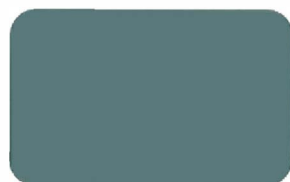
02 - SLATE BLUE

*Colors that meet "Cool Roof" requirements.