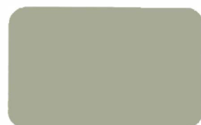
09 - ASH GRAY*