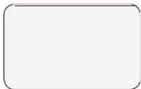
03 - ARCTIC WHITE*